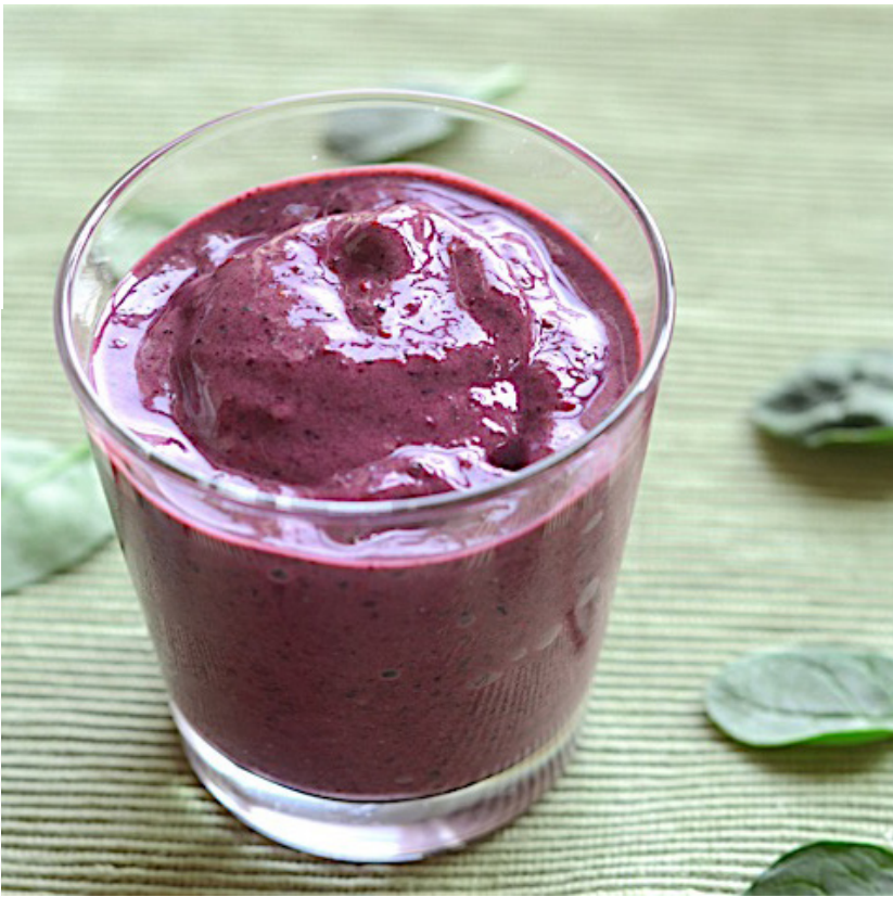
From NCG: www.strongertogether.coop/recipes

Put the berries and spinach in the blender first, and add the yogurt and banana. Process, scraping down as needed. Blend until smooth and serve.